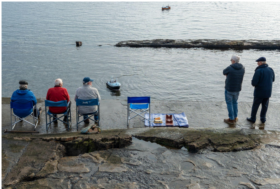
Members of the Anstruther Model Boat Club survey their fleet.